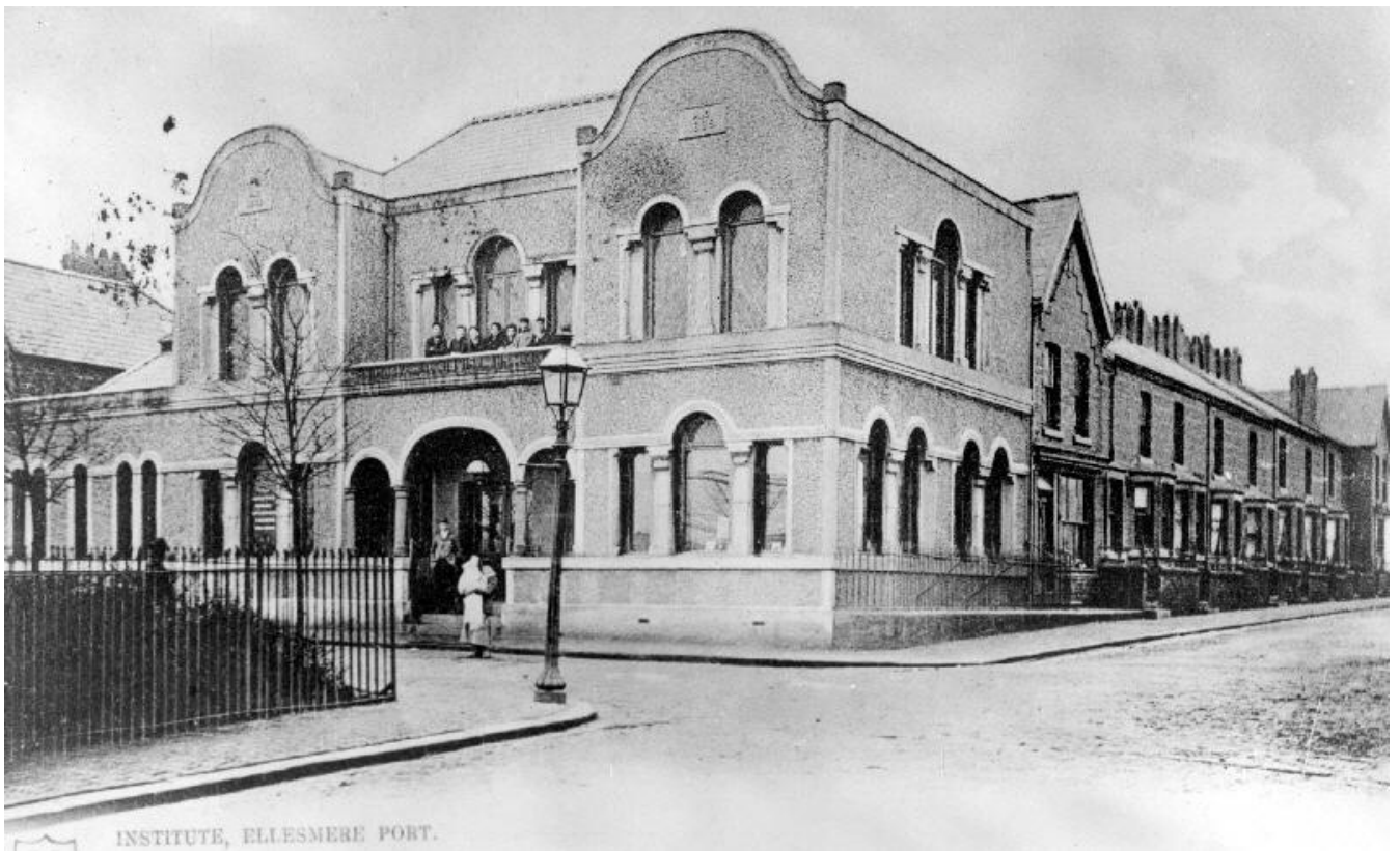
INSTITUTE, ELLESMERE PORT.