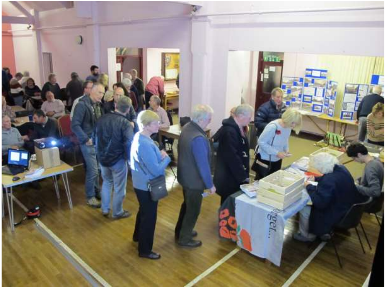
Book signing in the Memorial Hall